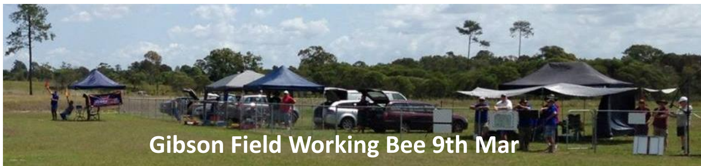
Gibson Field Working Bee 9th Mar