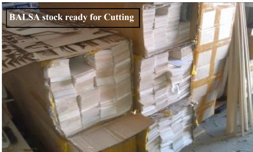
BALSA stock ready for Cutting