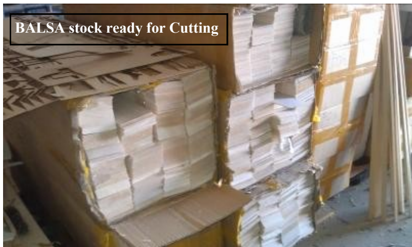
BALSA stock ready for Cutting