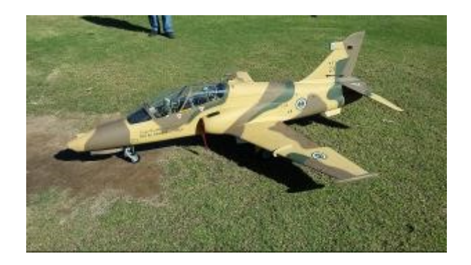
Dave's jet. Pilot's heads swivel.