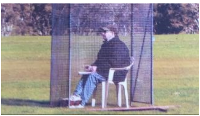
We need a cage like this!