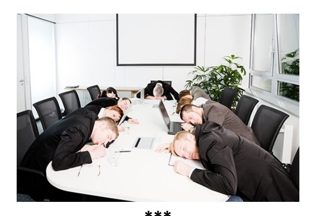
Take A Seat

With no further business to discuss, the meeting closed at 8:20 pm.